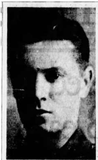
The Province – Vancouver BC